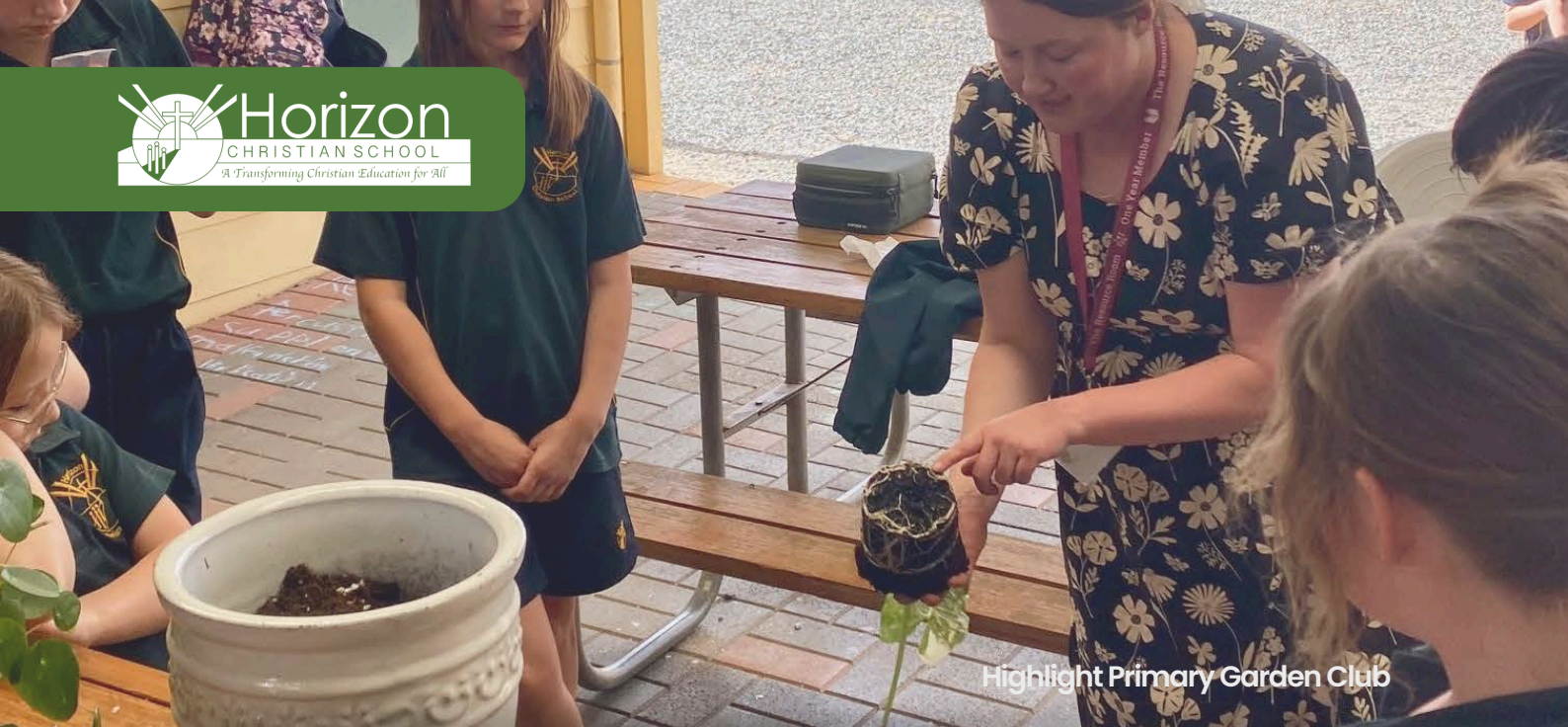
Highlight Primary Garden Club