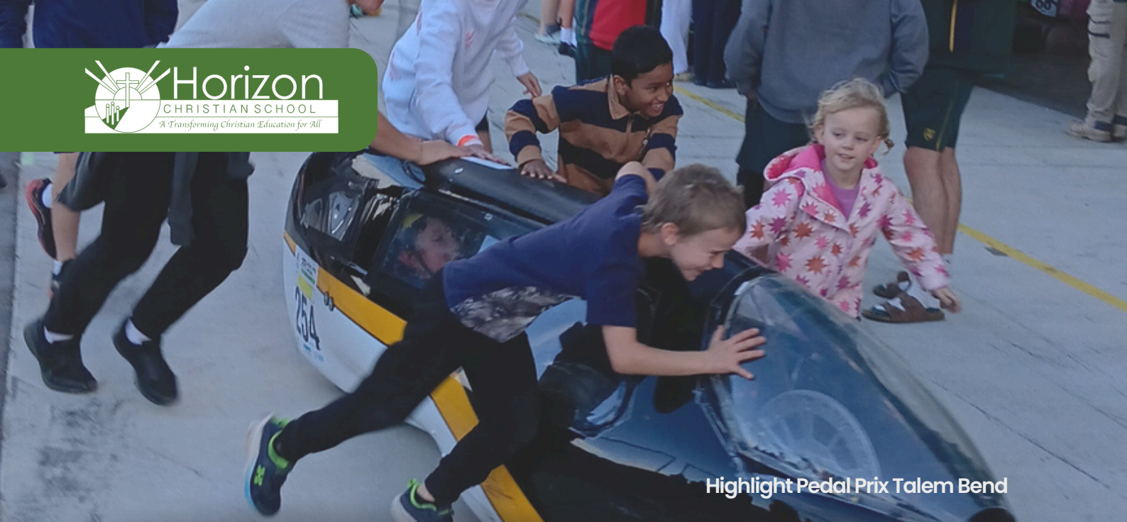
Highlight Pedal Prix Talem Bend